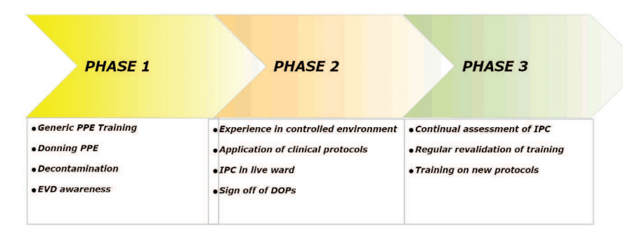
Figure 1. Three phase training model at Connaught Hospital Ebola Holding Unit.

All staff working in patient areas received the three-phase training described below (see Figure 1). Before starting clinical work, all staff had to complete Phase 1 and Phase 2 training. See Table 3 for an example of training timetable for Phases 1 and 2.